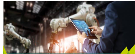
Maintenance Management 4.0