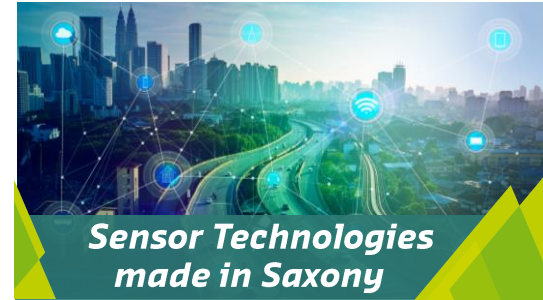
Sensor Technologies made in Saxony